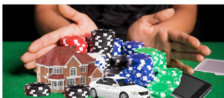
We proudly support Responsible Gaming Education Week.